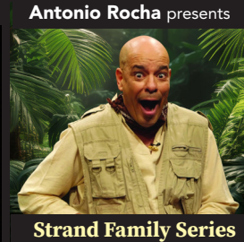
JUNGLE TALES March 8