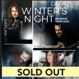
ON A WINTER'S NIGHT February 13