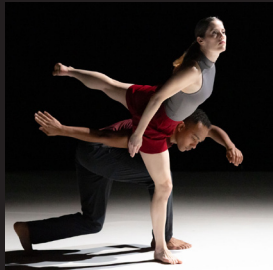
BOSTON DANCE THEATER February 8