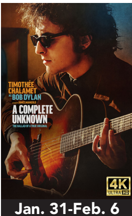
Jan. 31-Feb. 6