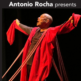
THE MALAGA SHIP March 7