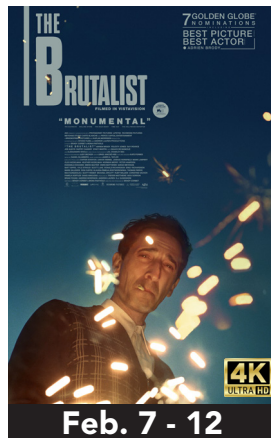
Feb. 7 - 12