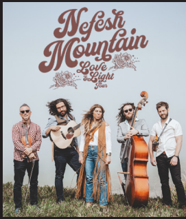
NEFESH MOUNTAIN Dec. 20