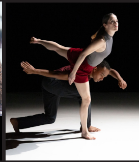
BOSTON DANCE THEATER Feb. 8